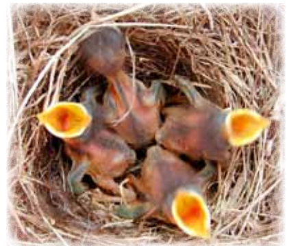
Feed Me, Please!