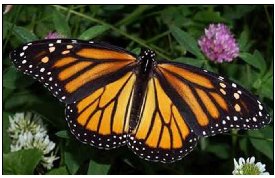
A Monarch Butterfly

Monarch Butterflies require specific host plants to reproduce. The female lays eggs on the host plants, the larval caterpillars feed on the host plant leaves and then the fascinating process of metamorphosis takes place with the formation of a chrysalis which turns into a butterfly.