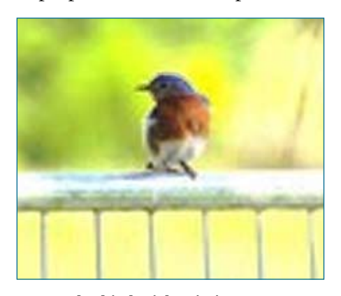
Bluebird with missing toes

by several things. There is a virus, Avian Pox that can infect feet, but is not limited to just the feet. It is quite common for baby birds to be born with birth defects that can include missing toe nails and or missing toes or parts of toes. Bumble Foot in birds can be caused by poor nutrition. Improper incubation temperatures