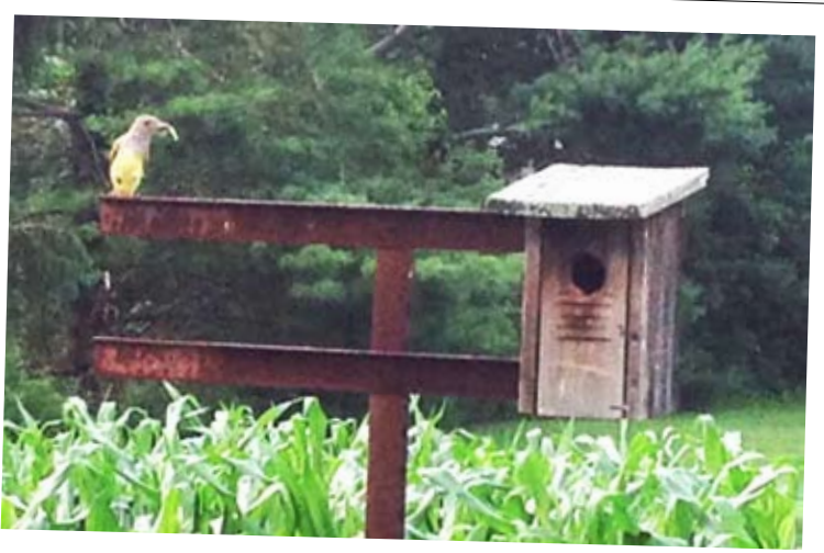
Great-crested flycatchers, young and adult