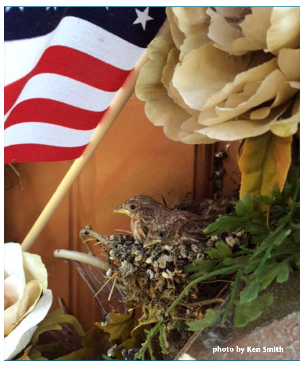
Young House Finches — Fledge Day

For more interesting facts about House finches, including that they only feed their young vegetable matter, check out: http://www.sialis.org/hofibio.htm