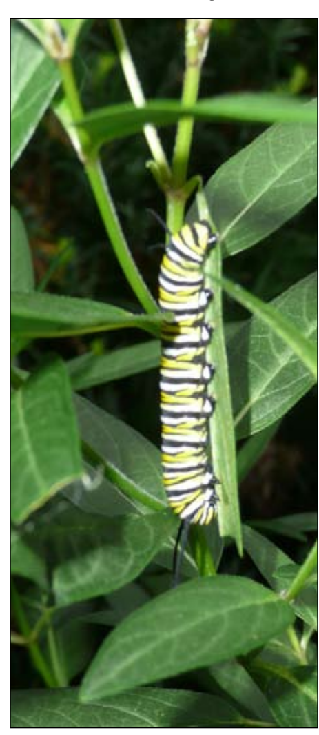
A Monarch caterpillar on swamp milkweed

For more information about how you can assist the Monarchs, check out: http://www.monarchjointventure.org/ http://www.monarchwatch.org/