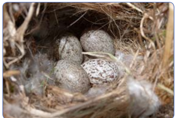
Non-native house sparrow eggs

In the nesting season 2021, 86 out of 129 (67%) of BSP Bluebird Trail Monitors reported that House Sparrows created problems for the native nesting songbirds along their bluebird trails. It is important to make sure that House Sparrows do not nest in your nest boxes. House Sparrows can nest multiple times per season and that accelerates the problem.