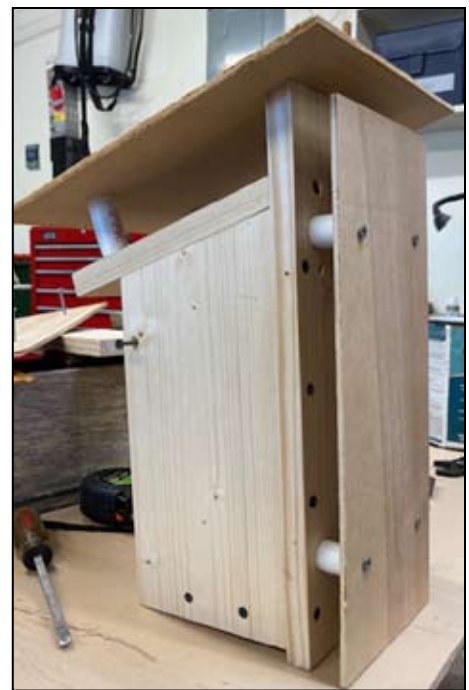
Top and rear panels before painting

sun setting in the west northwest, and if I were to re-position the face of the box to the northeast then the northern panel becomes effective. In northern areas such as Pennsylvania or Ohio, mounting the optional panel to the south side of the box is obviously preferable.