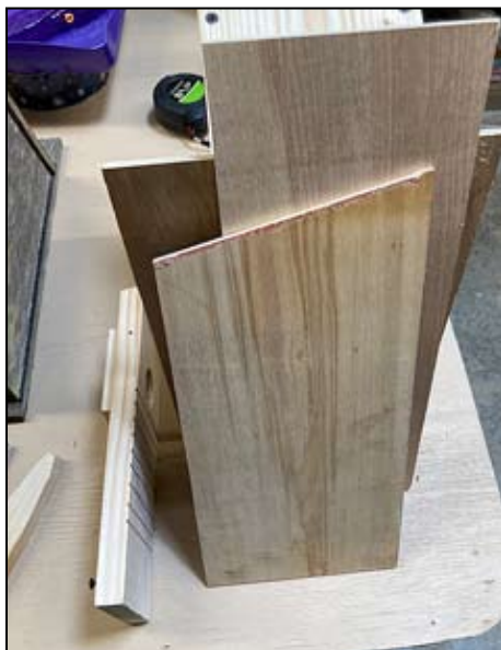
The three panels

the box and panels to allow for air circulation. Deciding which sides the outer panels would be located was