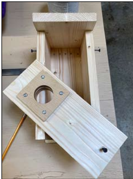
Starting out as a regular nestbox

As far as construction is concerned, my version is simply a regular nestbox, but with two or three wooden panels attached to the outside with plastic PVC spacers in between