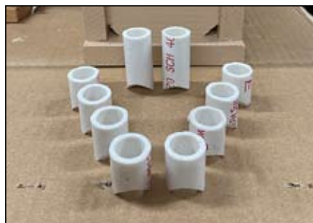
The PVC spacers with their drain slots