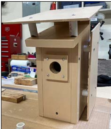
Final assembly after painting

a quality latex-based paint, it should be good for two or three years. For extra longevity, another option would be to apply a fiberglass resin or epoxy over the plywood. Either way, using nothing but screws (no nails) to attach the panels allows for easy removal and reinstallation at a later date. For the spacers, I used half-inch Schedule 40 PVC plastic pipe, but any rigid plastic tubing will work.