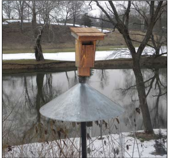
One of Dean's nest boxes with a disc predator guard

Eastern Bluebirds are typically found in open habitats with scattered trees and shrubs. Such habitats provide good foraging for bluebirds, which usually capture their insect prey on the ground. The trees and shrubs provide good hunting perches, and tree cavities can be used for nesting during the breeding season and for roosting during the nonbreeding season. Bluebirds can be less discriminating during the nonbreeding season, when the presence of a nearby cavity is not essential. They are sometimes found in more wooded habitats during winter. These areas may provide fruits, nuts, & berries and also provide greater protection from the elements (wind, rain, and deep snow).