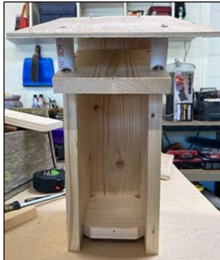
Test fitting the top

the box and panels to allow for air circulation. Deciding which sides the outer panels would be located was