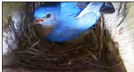
#1 - Male Bluebird on Top of Eggs

bird sitting on top of the eggs (photo #1.) We watched him settle over the eggs almost every day. Their clutch successfully hatched and fledged three Eastern Bluebirds. We think it's plausible that the male's incubation helped the eggs reach maturity.