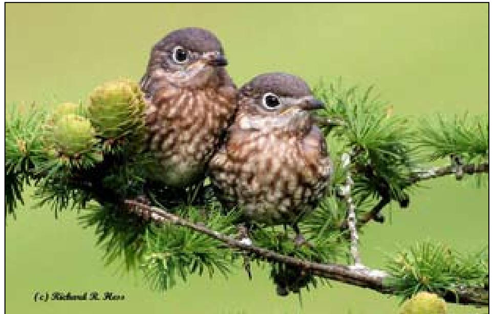
Bluebird Fledglings

2) To submit by regular mail, write: Attn: Newsletter Submission contest on the front of the envelope and send to: BSP, P.O. Box 756, Mechanicsburg, PA 17055-0756