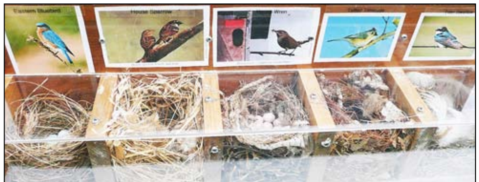
BSPs nest display as seen at the Pennsylvania Farm Show

This is a fun event for the entire family, with interesting events, demonstrations, a variety of animals, vendors, and offers delicious PA food choices in the food court. Volunteers are needed