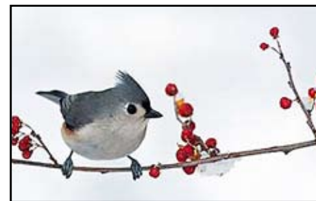
Tufted titmouse in winter