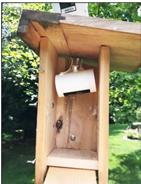
#8 - Nestbox interior with the ring stick up cam installed

where they can be viewed on the Smartboard, Ipad, or computer in each classroom. Young students learn about, and enjoy watching, Eastern Bluebirds at work, in real time. For this to work a WiFi signal is necessary, and the signal must reach the nestbox. Since many school districts have this technology, views of Eastern Bluebirds at work in their nestboxes are now possible.