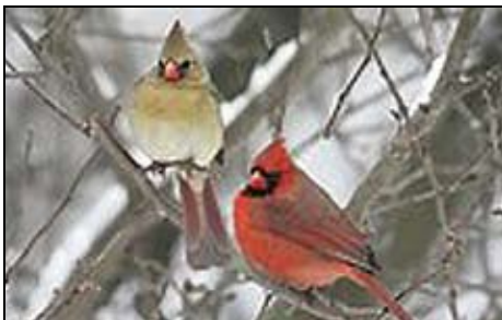
Female and male cardinals in winter

For More Information: gbbc.birdcount.org/