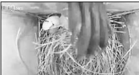
#4 - Paw of Raccoon Reaching into Nest Box (night of July 18, 2019)

The next morning, we found the lone hatchling still alive. We removed bits of shell from its body and fed it a few mealworms. Then we installed a Noel Guard over the opening of the box. Sadly, either the parent bluebirds did not accept the Guard or they were traumatized by the attack of the predator, they abandoned the box. By the time we removed the Noel Guard, the parents had left the area and the lone hatchling perished before we could match it with foster parents or to contact a Wildlife Rehabber.