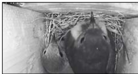
#2 - Male & Female Bluebirds on Nest at Night (Ring Camera)