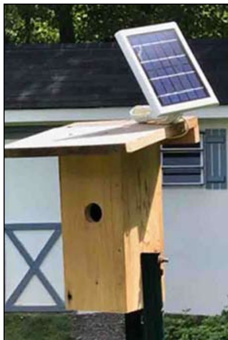
#7 - The nestbox with its ring solar panel on top, facing south