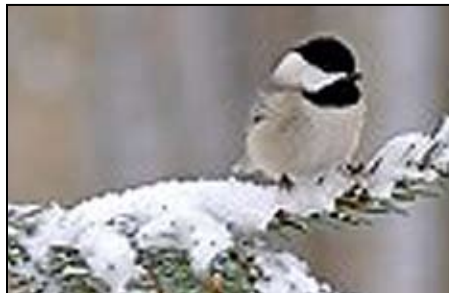
Chickadee in winter