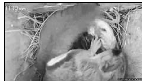
#3 - Flying Squirrel Attacking Nestling Inside Nest Box (screen shot 11 p.m. on July 10, 2019)

Should we attach a Noel Guard? No, this guard had never been installed on the box, so we weren't sure how the parents would react to it. Sometimes a Noel Guard threatens adult birds and leads to their abandoning the nest. We know of cases in which Bluebird eggs perished when this device scared away the parents. Using the Noel Guard should be a “last resort” if adult birds are not accustomed to it.