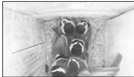
#6 - Six chickadee nestlings—close to fledging (screen shot March, 2019)

In March, a pair of Black-Capped Chickadees started a nest inside a RING-equipped nest box. We watched in awe as the female brought bits of moss and fur into the nest box. She was more active than we thought possible, spending many hours a day tucking moss into different sections of the floor. She spun around in her nest many times, as if she were a perfectionist. We watched for a week as she arranged and re-arranged nesting material. Her dedication and sense of purpose exceeded every concept we had of nest construction. Finally, she began laying eggs – a total of 6. Both male and female Chickadees incubated eggs, and both tucked themselves into the nest box at night. The feeding of nestlings was surprising and entertaining – as tiny bits of insects were pushed into the mouths of hatchlings. In addition, we were startled by the vigor with which the parents jammed their beaks beneath the nestlings to retrieve fecal sacs. Five of the six fledged. One died of natural causes.