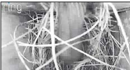
#5 - Paw of Raccoon digging into nest, searching for eggs and nestlings. Note the typical tearing-up of nestbox materials (night of July 18, 2019)