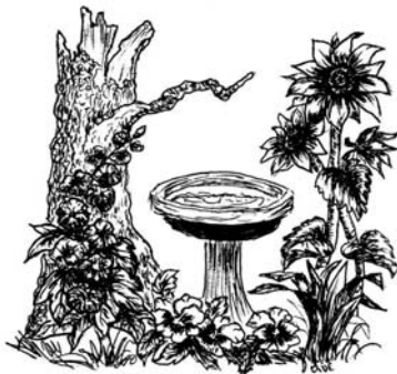
Artist - Susan Renkel

If you don't have a bird bath, you need to get one. On an average day, we see goldfinch, cardinals, tufted titmice, chickadees, and blue jays. We even have a squirrel stop by for a drink. Just remember to keep it clean and filled with fresh water, especially when the blues are done, and you, too, can have trouble reading your novel!