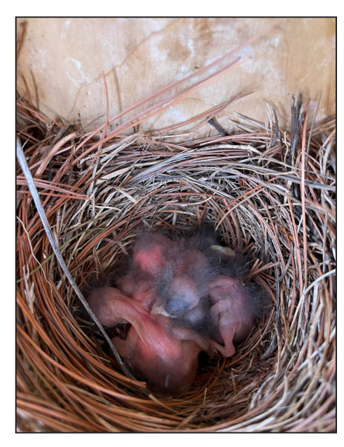
Baby Bluebirds

which fledged on 8/25/2022. I also feed dried mealworms (and occasionally live mealworms) and noticed that those two young bluebirds from the last nest stayed with their parents all winter, and I still sometimes see them at the mealworm feeder or birdbath with the parents. The male parent started chasing other males away from the feeder and birdbath around February of this year, but