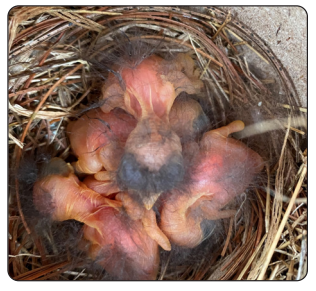
Baby Bluebirds

There are many factors which can cause a nesting attempt to fail. Below is a list of the main causes of nesting failures, and some ways to reduce the risk of these losses. However, in spite of doing everything right, there will still be nesting failures, so avoid the trap of feeling responsible for the loss of eggs, young, or adult birds.