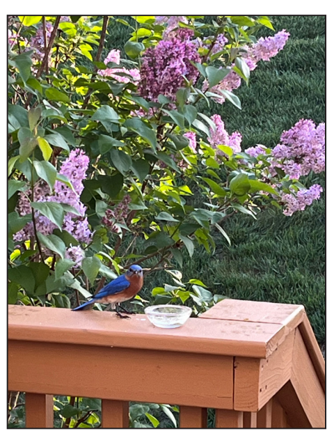
Male Bluebird

Bluebirds breed in their second year and are generally 10-11 months old the first time they breed (if they can find a mate). They will breed annually thereafter.