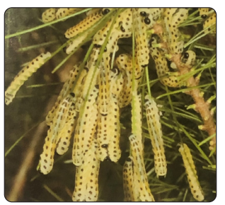
Diprionid Sawfly Larvae

Note: The Bluebird Society of PA was registered with the AmazonSmile Charity Program and received quarterly donations from Amazon based on a percentage of purchases made by members who designated BSP as their charitable organization. BSP Thanks Amazon and all of our members who participated. However, as of February 20, 2023, Amazon discontinued this program, as they felt that the program had not grown to create the impact that they had originally hoped.