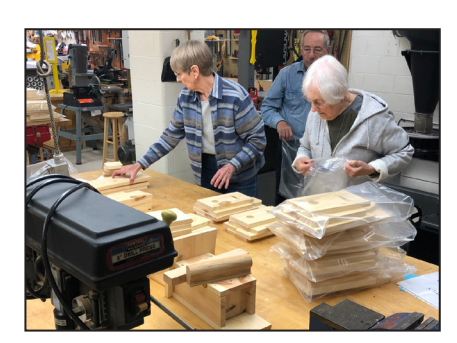
Nestbox building activity at Willow Valley North Woodshop