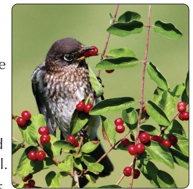
Juvenile Eastern Bluebird by Richard Hess

Bluebirds enjoy. White Dogwoods ( Cornus florida ) produce a red berry that Blues savor. American holly (Ilex opaca) has red berries – a Bluebird favorite. A third variety was two Zumi flowering crabapple trees ( Malus zumi calacarpa ). Previous owners had planted these two trees. We have watched Ring-necked pheasants sit in these trees (not in the last 20 years!!) and flocks of Cedar waxwings devour the abundant fruits in the late spring when they are softened and fermented. In some respects, it "turbo-charges" the birds' flying ability!!