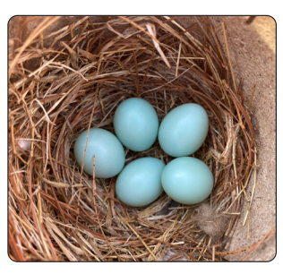
Bluebird Eggs