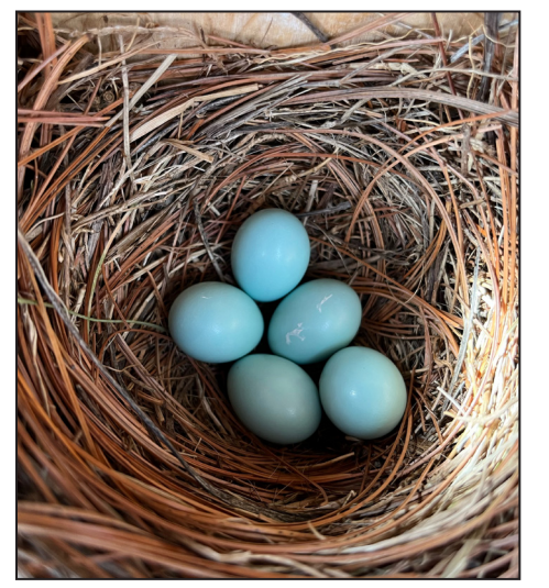
Bluebird Eggs

After feeding bluebirds for a few years, I put up my first bluebird nest box last spring. To my delight, a pair noticed my nest box fairly quickly and began nesting in April of 2022! I promptly joined the Bluebird Society of PA and began learning about how to be a good landlord. There were three broods last season and all babies fledged with the exception of one egg that did not hatch. The last nest of the season produced two chicks