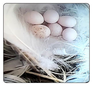
Tree Swallow Nest and Eggs