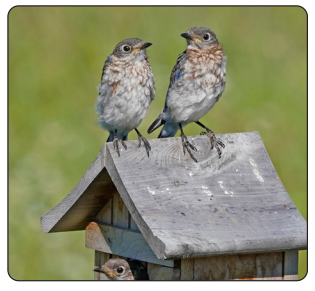
Bluebird Fledglings